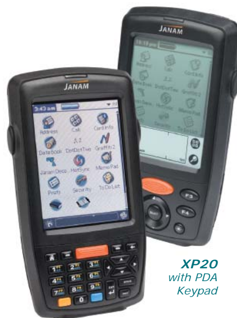
XP20 with PDA Keypad

The XP30 is the world's first fully-featured mobile computer that scans barcodes and runs the latest version of the Palm OS. A brilliant, color, quarter-VGA display and blazing Freescale™ architecture make the XP30 a best-of-breed, rugged, barcode scanning, mobile computer, while its list price makes it impossible to ignore. For customers who want to extend the reach and capability of their mobile Palm applications, the XP30 has the horsepower to execute mission-critical data collection tasks at the point of business activity. And for customers who are ready to switch to the Palm OS for its simplicity and its durability, the XP30 is a platform that pays for itself twice as fast as comparable devices.